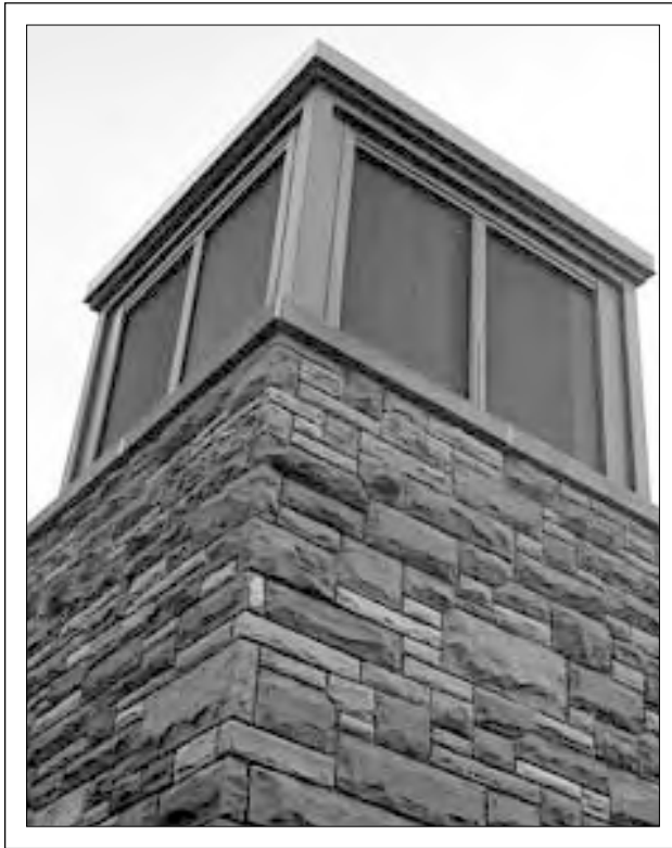
Passive down-draft cool towers at the Visitor Center in Zion National Park (in Springdale, Utah) help bring temperatures down by cooling hot air with water at the top of the tower. This cooled air then falls into the building and onto the patio.