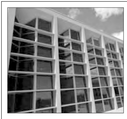
The Trombe wall at the NREL Visitors Center in Golden, Colorado, provides passive heating and daylighting to the exhibit hall.

Cost and technical analyses are conducted at the same time in passive solar design to optimize investments for maximum energy cost savings. It is rarely feasible to meet 100% of the building load with passive solar, so an optimum design is based on minimizing life-cycle cost: the sum of solar system first-cost and life-cycle operating costs. Means Assemblies Cost Data is a good source of cost information for thermal storage walls (Trombe walls) and other selected strategies. It is difficult to separate the cost of many passive solar systems and components from other building costs because passive solar features serve other building functions—e.g., as windows and wall systems.